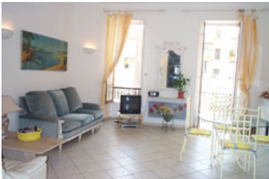
Lounge – looking towards the balcony