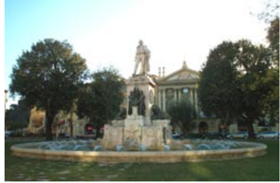
Place Garibaldi – 30 metres away