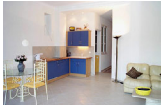
-and looking towards kitchen