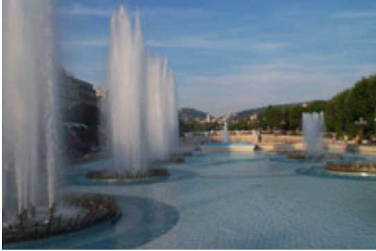
Place Massena – 300 metres away